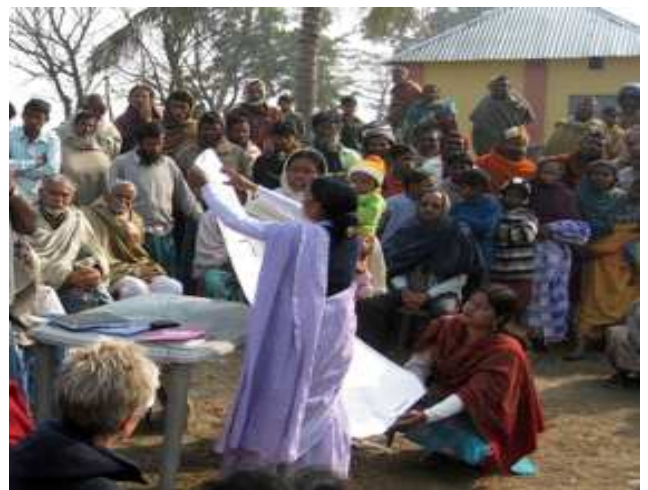
Mothers present village map to their community Raiganj

help the mother, help the child... www.ciniaustralia.org