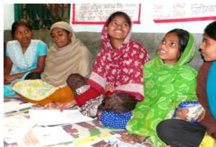
Out-of-school-girls learning centers

This approach to education for "at risk" children is very effective and we saw clear evidence of generational change in the successful young adults we met.