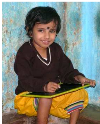
Night time safety – little girl in Rambagan evening learning center