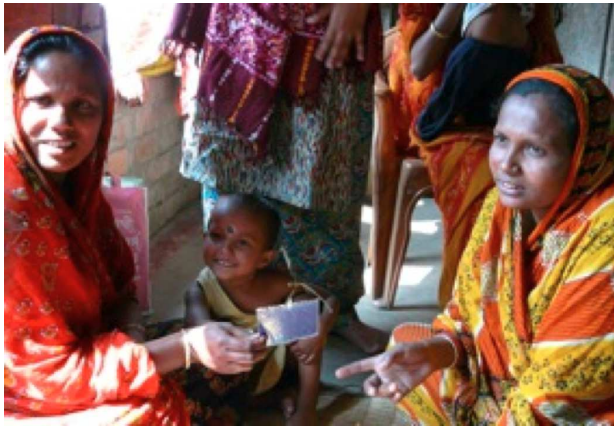
Health worker shows mother preschool play

On this day we acknowledge and thank our mothers for what they have done for us; wish new mothers courage and good luck in their mothering and recognize grandmothers for their part in the family